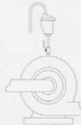
Model 1AV venting air from a centrifugal pump.