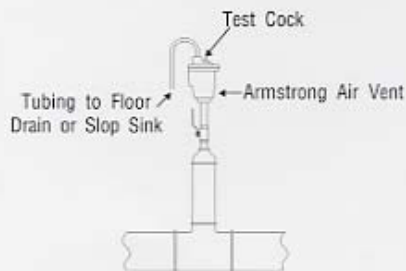
Model 1AV automatically venting air from a pipeline.